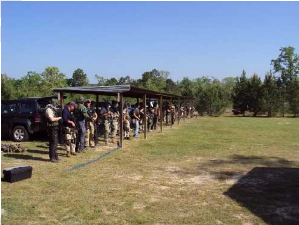
100 Yard Line