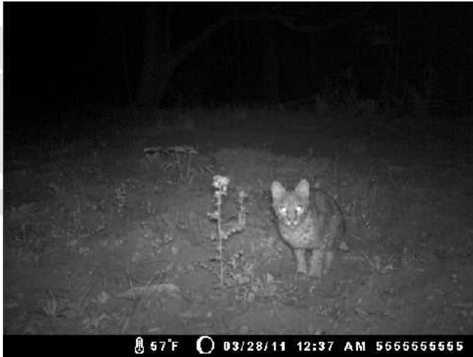
Kitty cat or Wild Cat???