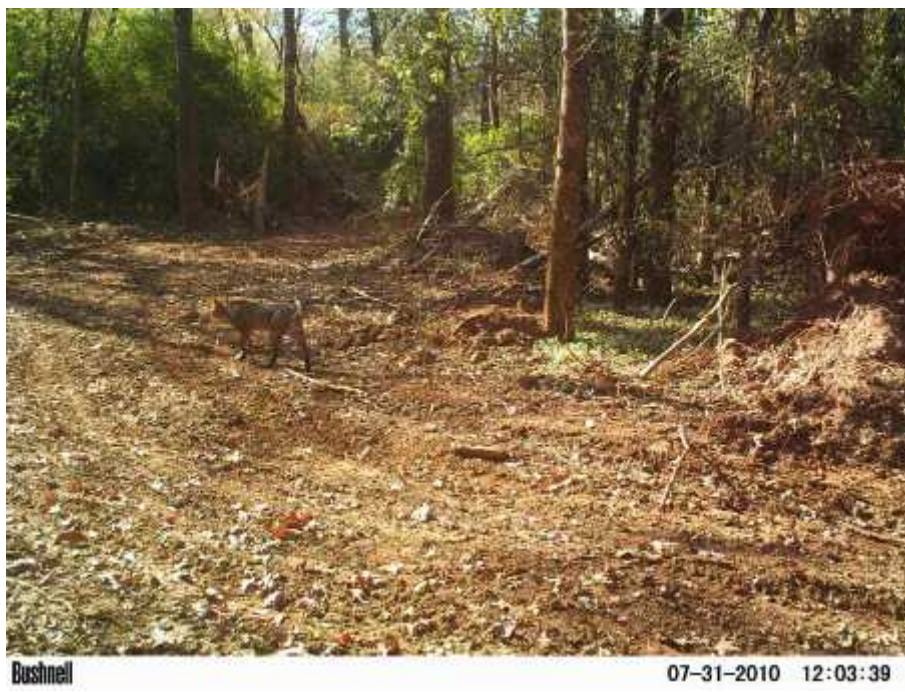
This is a stout bobcat...